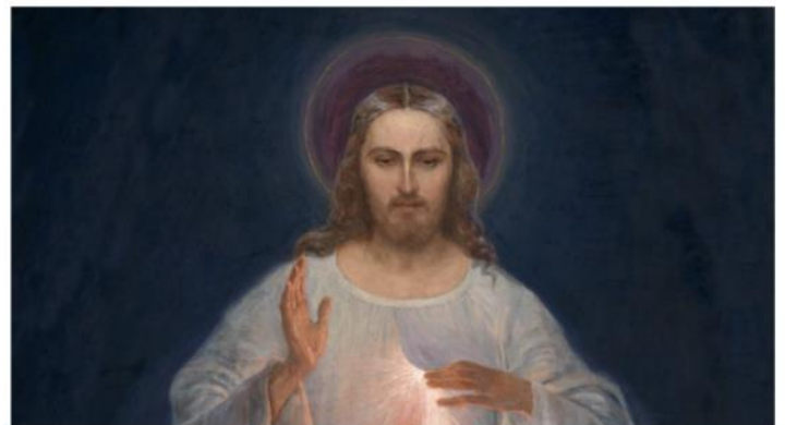
Recitation of the Divine Mercy Chaplet & Prayers