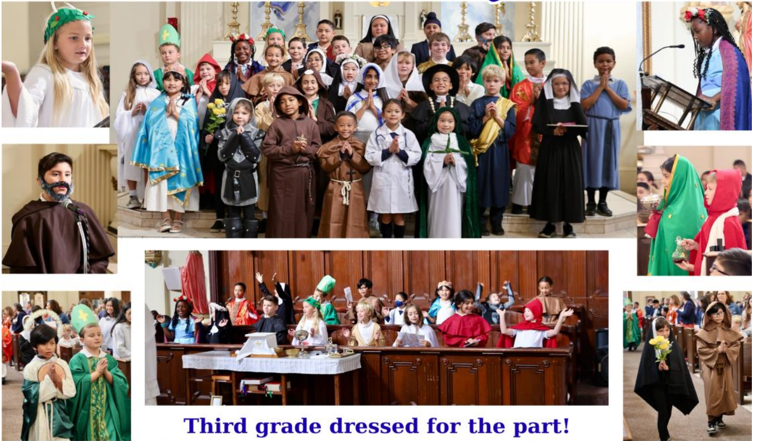
Third grade dressed for the part!

SDS gathered this week with hearts full of gratitude and reverence for All Saints Day. May the saints continue to be lights on our path to holiness, and may we follow their examples with faith, courage, and kindness each day.